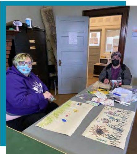
Sessionals participants and their creations