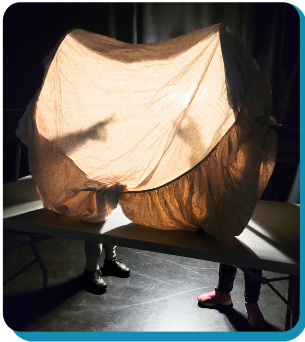
Here is a picture of a couple of our participants improvising a shadow play scene.

Theatre troupe has been busy and had a lot of positive changes lately!