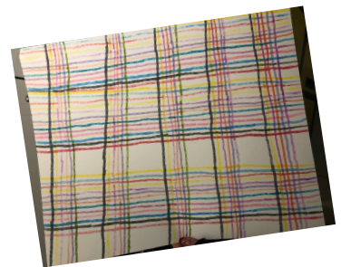
Artistic creations galore!